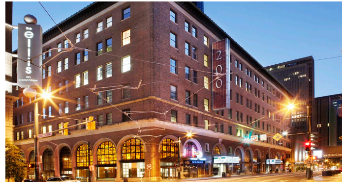
Equinix AT1 IBX data center exterior

To learn more about interconnection opportunities in Atlanta, visit the Explorer feature within Equinix Marketplace .