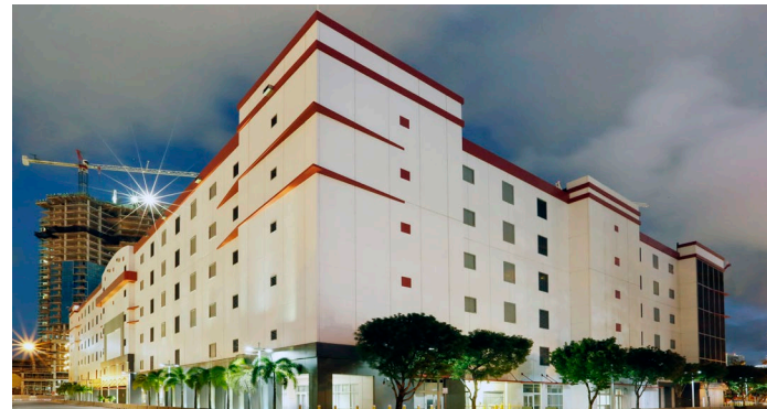
Equinix MI1 IBX data center exterior

To learn more about interconnection opportunities in Miami, visit the Explorer feature within Equinix Marketplace .