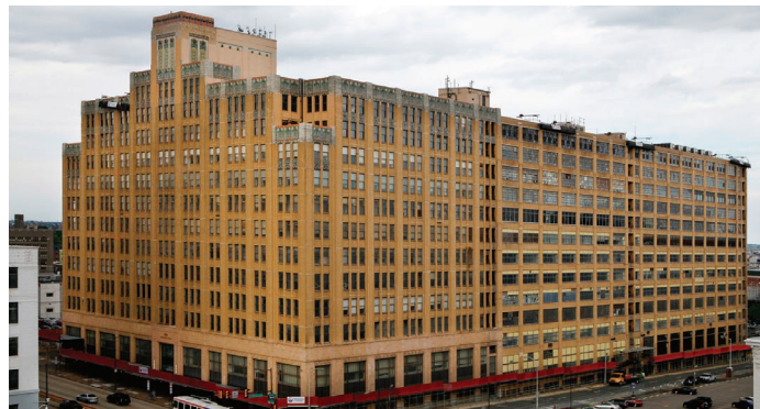
Equinix PH1 IBX data center exterior

To learn more about interconnection opportunities in Philadelphia, visit the Explorer feature within Equinix Marketplace .