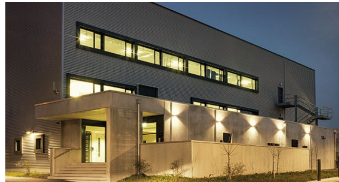
Equinix ZH5 IBX data center exterior

The Equinix Zurich metro International Business Exchange™ (IBX™) data centers consist of four buildings with more than 100,000+ square feet (10,050+ square meters) of colocation space. Compliant with key international standards including ISO 9001: 2008 for quality management systems and ISO 27001 for information security management. ZH5 is Gold LEED certified for environmental sustainability.